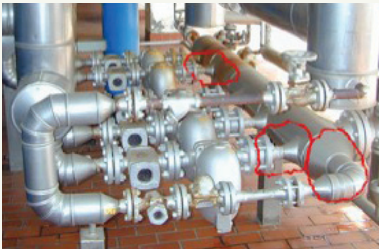
Figure 1: Red circles show improper connection to the condensate header. Instead of connecting into the side of the condensate header, the returns should enter in the top of the manifold (condensate header).

Unfortunately, steam systems are experiencing some type of water hammer. Many mistakenly believe that water hammer is unavoidable, and a natural part of steam and condensate systems. This is entirely false. If the system is properly designed and correctly operated, water hammer in any form will not occur. It is possible to have high pressure steam systems operating without water hammer and a long operational life from the steam components.