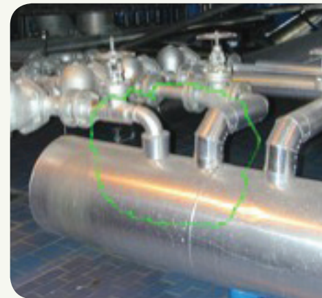
Picture indicates the proper connections to the main condensate header.